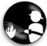
Fire and Rescue Safety