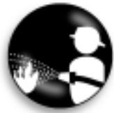
Fire and Rescue Safety